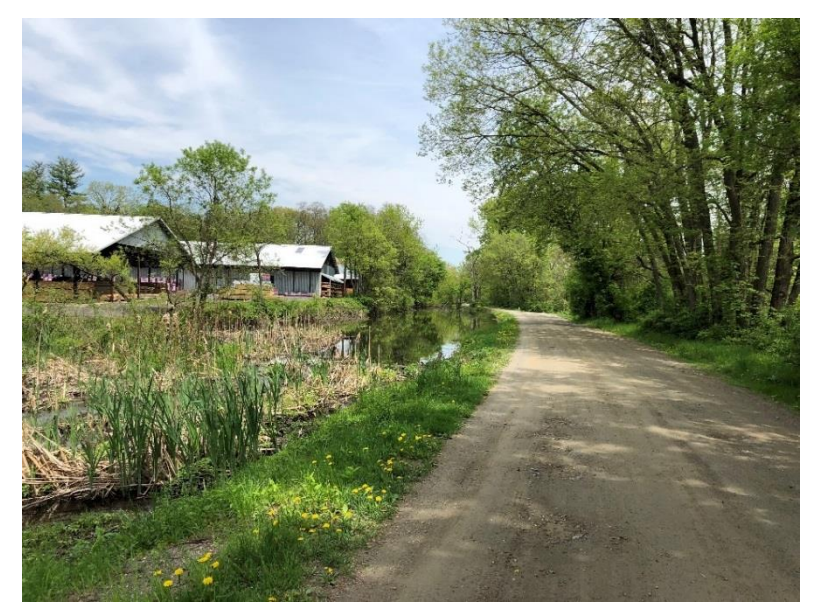
Empire State Trail on Towpath Road Looking North