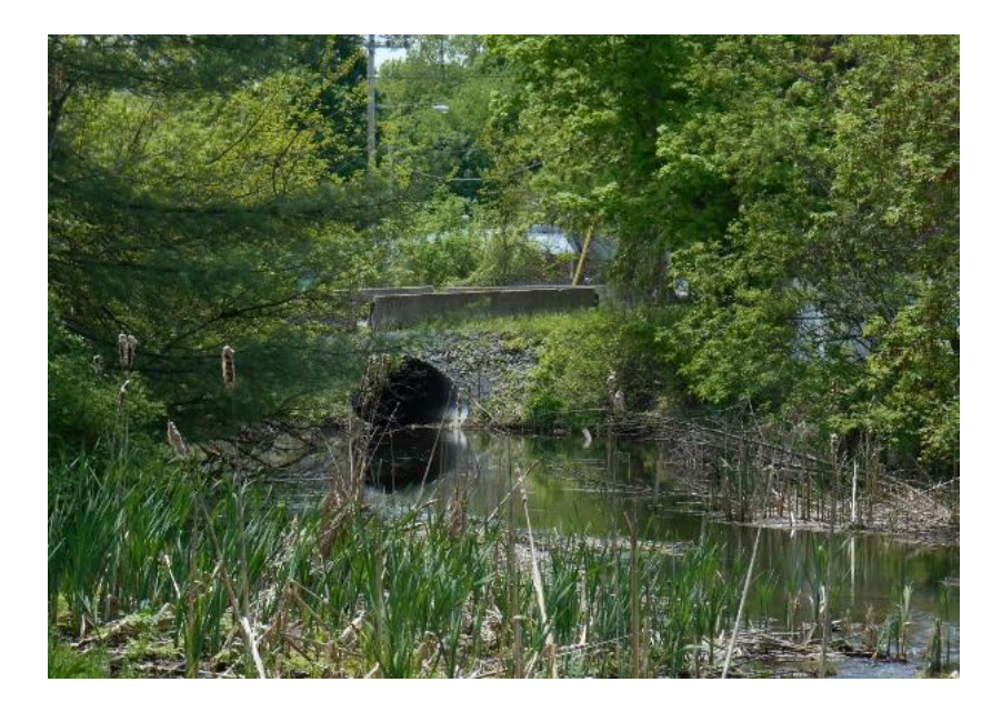
Reds Street Culvert Obstructing Water Flow Looking South