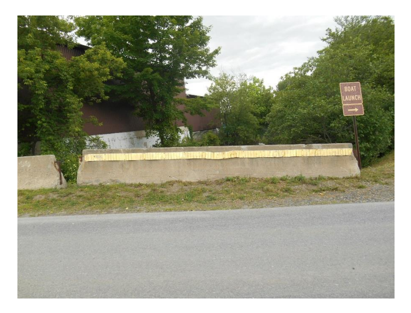
Jersey Barriers above Reds Street Culvert Looking North