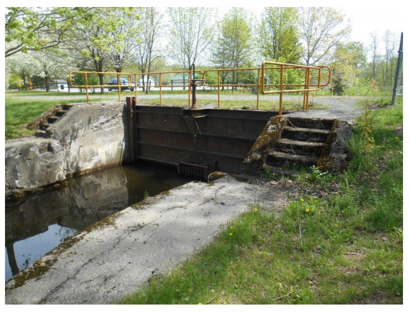
Historic Junction Lock with Restricted Water Flow near Lock 5 Looking South