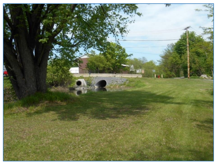
Culvert under Reds Street from Fort Hardy Park Looking North