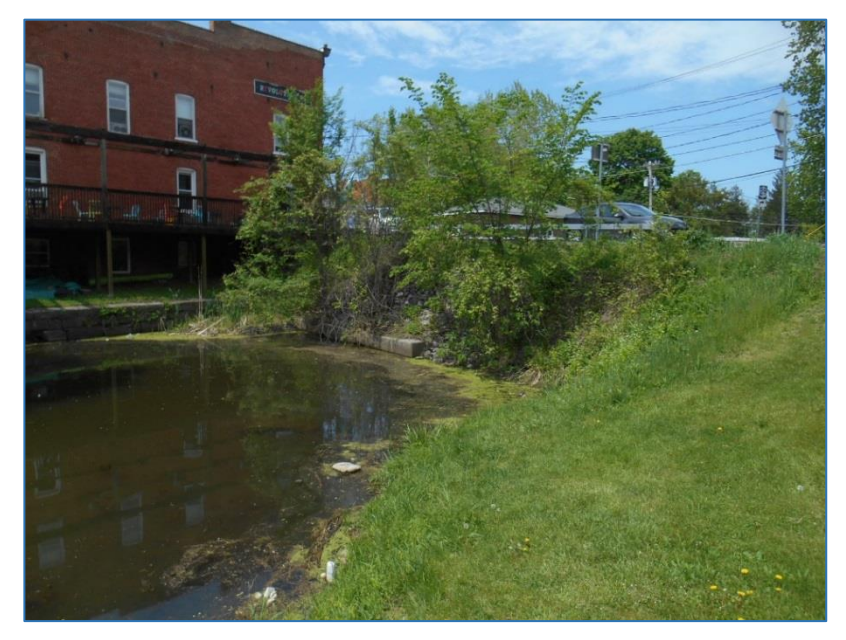
Sediment-Choked Culvert under Route 29/Ferry Street Looking North