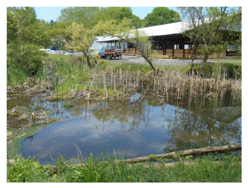
Restricted Canal Flow North of Fort Hardy Park Looking West