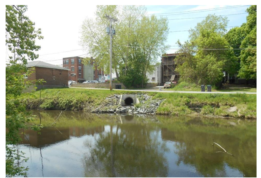
Culvert along Canal Street Looking West